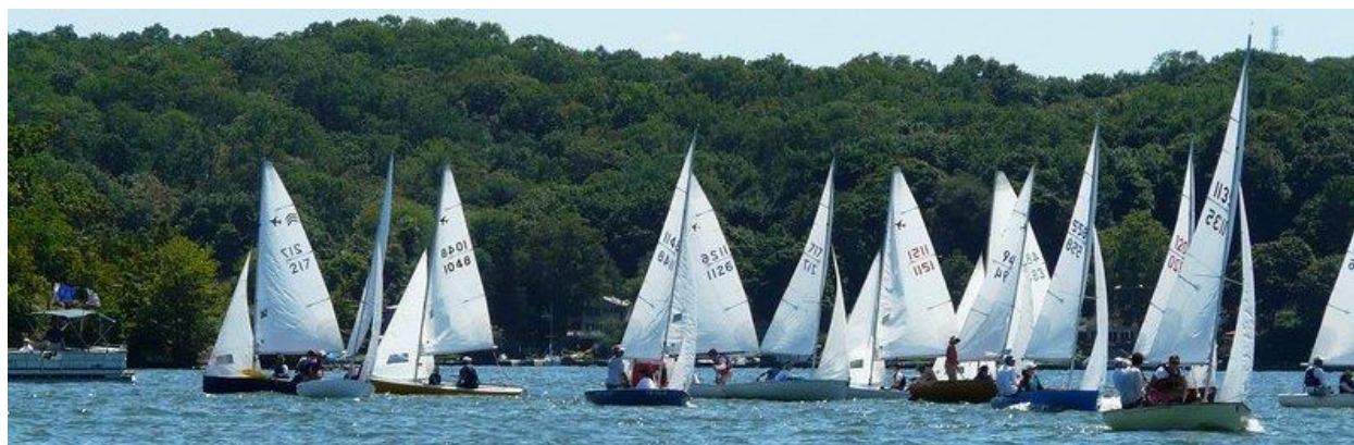
Jets fly uphill at the 2011 Nationals. View all the pictures from the event at jet14.smugmug.com .

Located in Northern New Jersey, Lake Hopatcong is easily accessible just minutes off I-80. More details to follow shortly on the Class website.