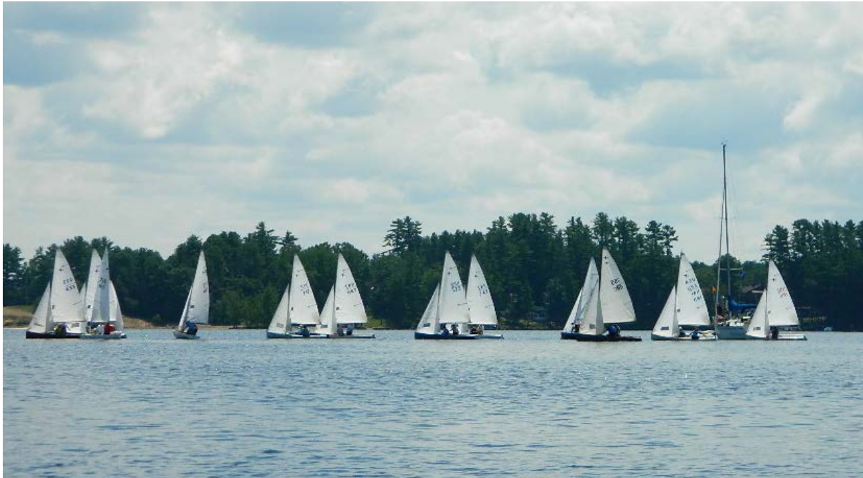
Above: Jets jockey for position at the start of the 2021 Nationals at Mayfield YC