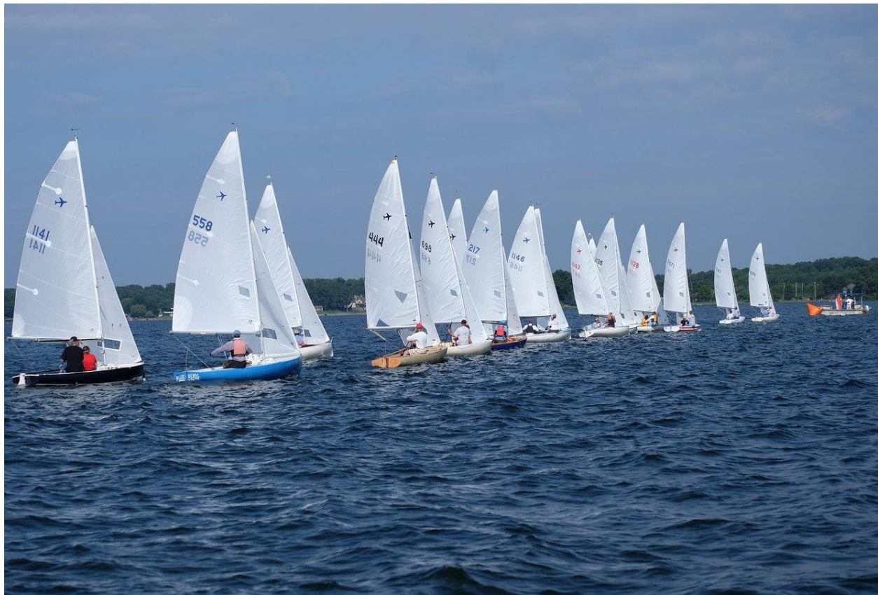
Above: The fleet lines up for a start on Friday at the 2018 Jet-14 Nationals on Lake Norman, NC.