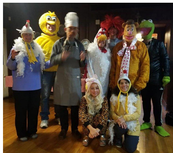
Above: The North Carolina crew posing as some of the best looking Muppet characters one will see. Jim Henson would be proud.

Some may have changed their plans and did not join us, but hard to tell after 15 boats registered to race. And many of those made an extra effort getting crew, or travelling, or getting their boat repaired in time to be here. That all is absolutely not lost on me. Thank you one and all.