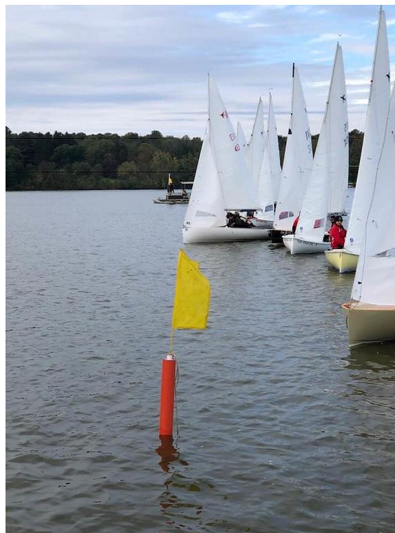
Above: Race 6 start on Sunday morning.