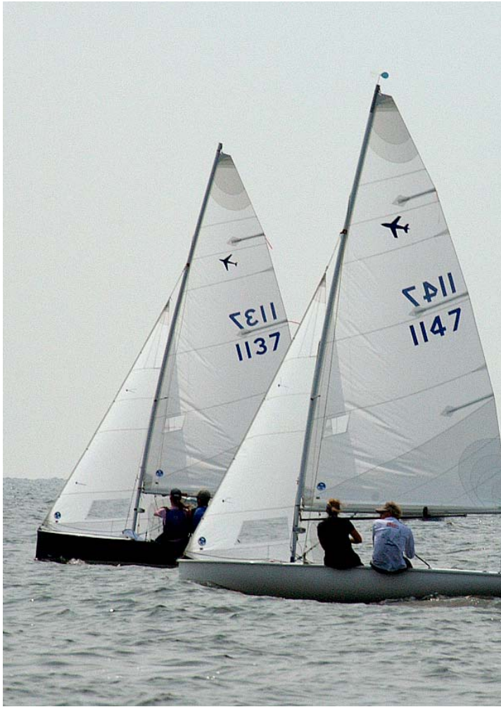
The Fishers(#1147) and Schwenks tune upwind. Check out the low over-bend wrinkles on the mainsails. This is achieved by chocking behind the mast, effectively bending the mast and flattening the bottom of the mainsail.

in a lull. This leeward shroud wiggle was a nice way to have confidence we were “in the ball park” tension wise. We double checked our tuning guide jib halyard rig tension numbers against the “wiggle” tension numbers and they seemed always to be very close so that was great.