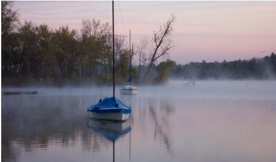
A frosty morning at Charles Mill Reservoir, home of Mohican Sailing Club