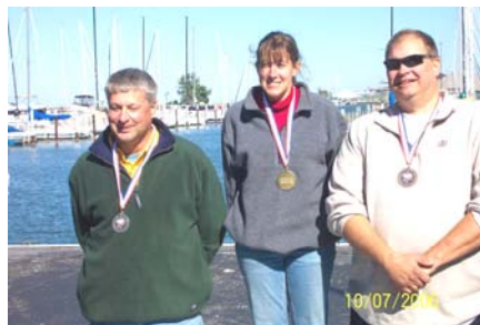
Chili Cook Winners Sporting Medals