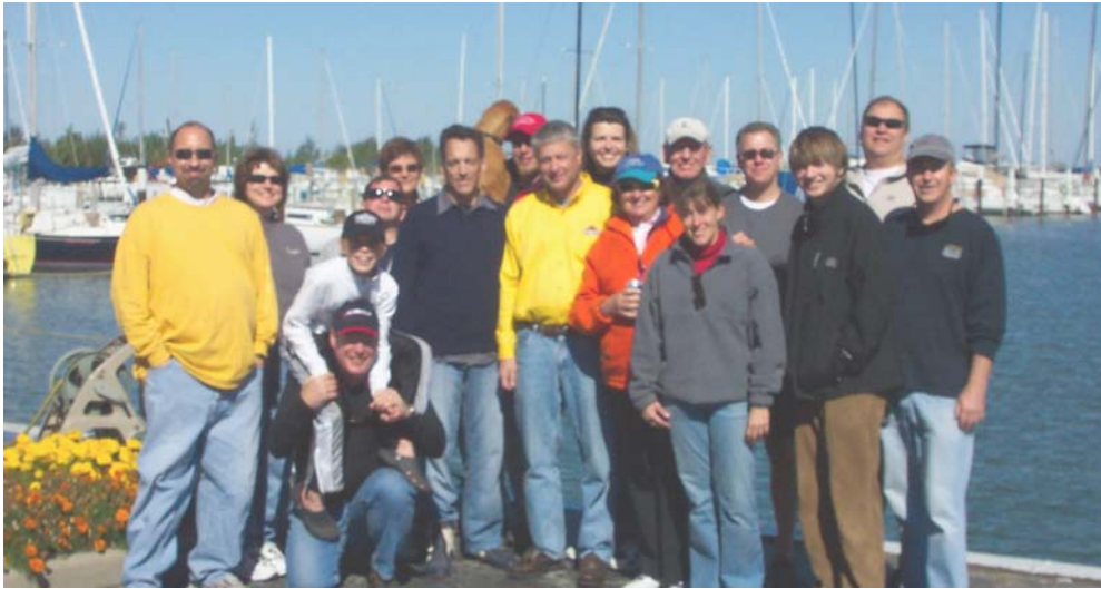
2006 Chili Bowl Participants: The event keeps growing; the Chili's improving!